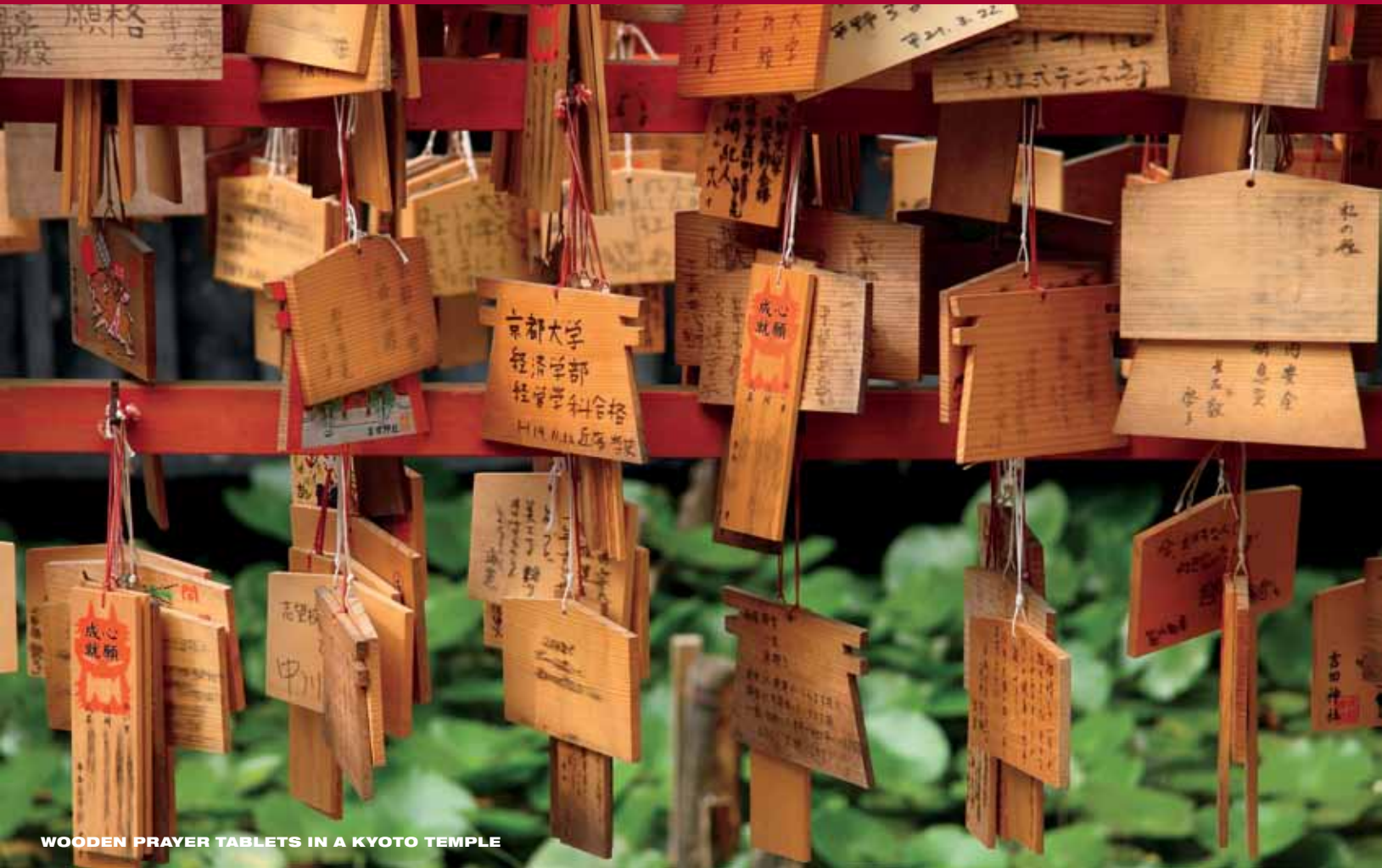
WOODEN PRAYER TABLETS IN A KYOTO TEMPLE