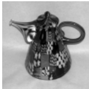
Ceramic teapots (left and above)

itory with 160 students. During his long tenure at Stanford, he was father figure, mentor, and exemplary teacher to generations of graduates and undergraduates.