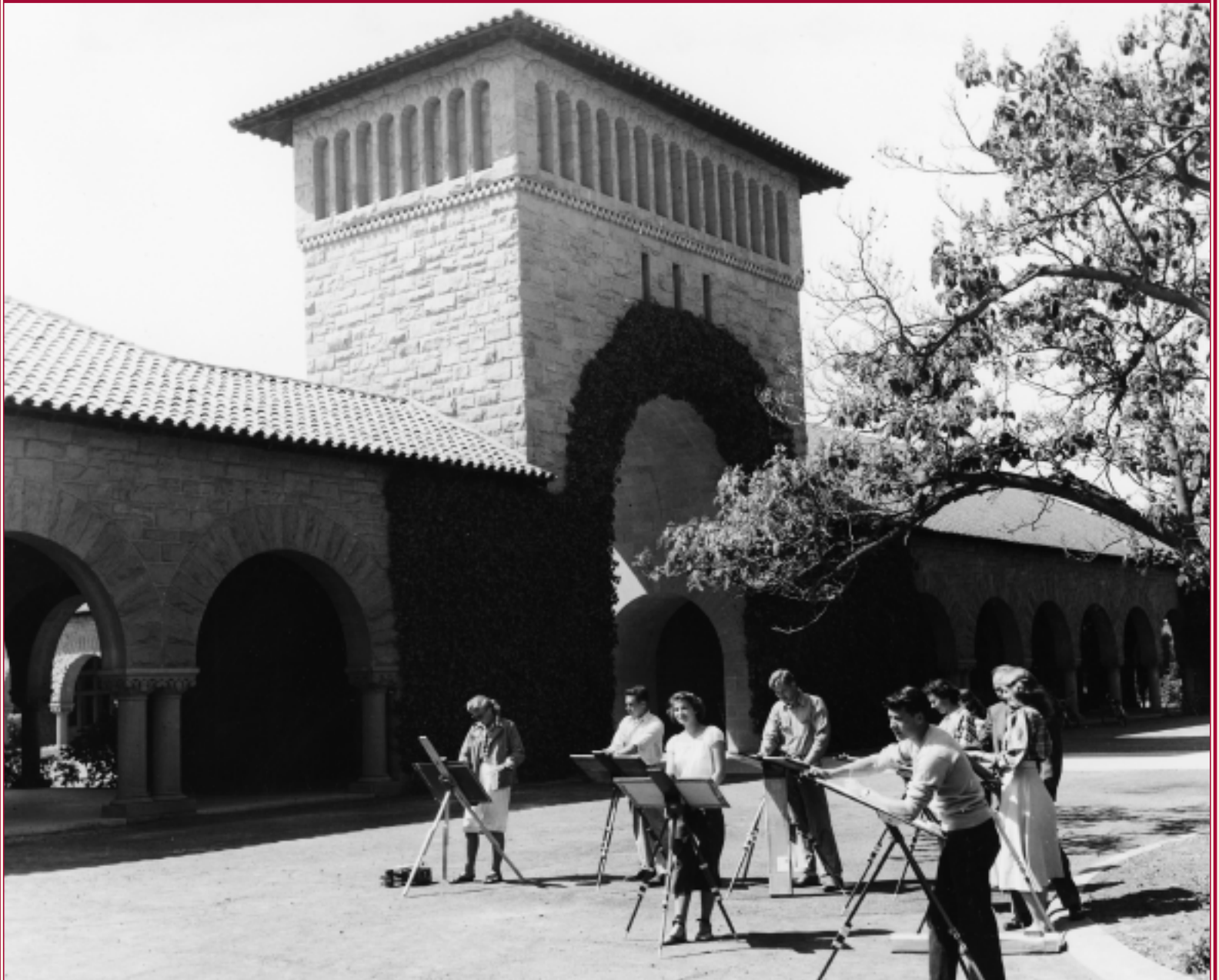
STANFORD SCRAPBOOK Studio art students on the Main Quad in the 1950s