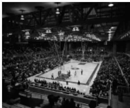
Basketball in Maples Pavilion